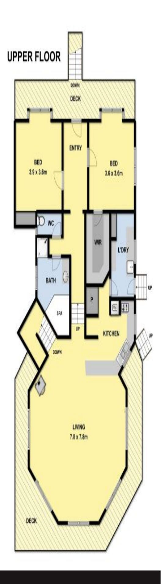
Plans shown are only indicative of layout. Dimensions are approximate.